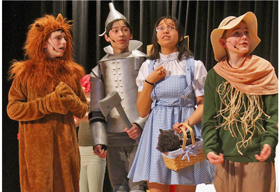
Live Performances Return: Eagle Hill and Wellwood middle schools' drama clubs each presented spring musicals this year. Eagle Hill students performed Disney's Beauty and the Beast, Jr. , and Wellwood Middle School students presented Wizard of Oz (pictured above).